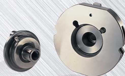
Positive Keying = Less Scraped Parts