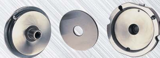
Precision Ground Spacer = Extra Grind Life

www.wilsontool.com sales@wilsontool.eu.com