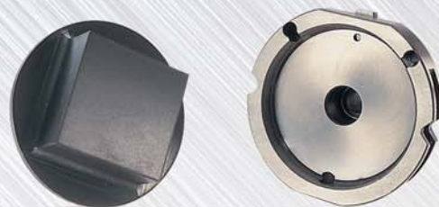
40-76.2 Punch Holder