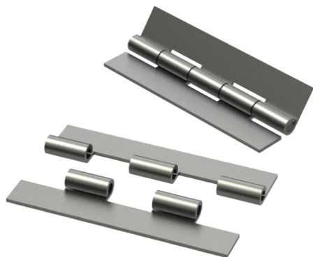
Standard Fully Curled Hinge