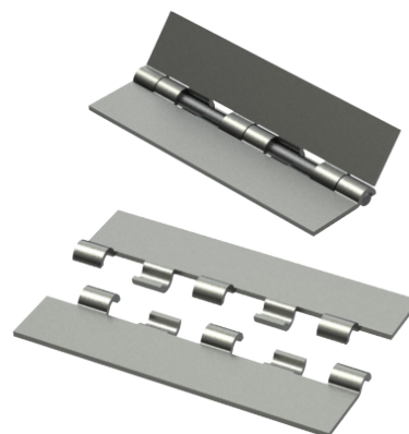
One-Hit Half Knuckle Hinge